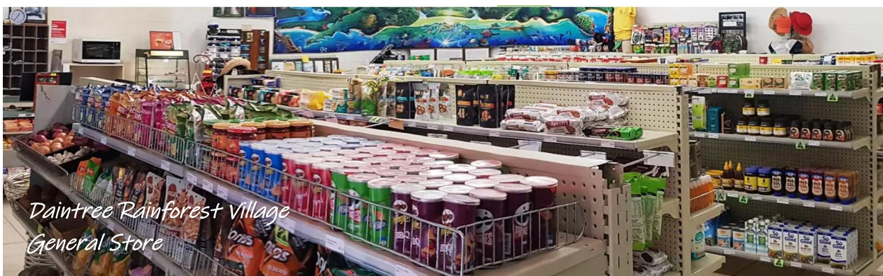
Daintree Rainforest Village General Store

Located on Cape Tribulation Road, this is the biggest little supermarket in Daintree. It stocks fresh produce and dairy, meat, seafood, ice creams, snacks and confectionery, canned and frozen foods and desserts, a range of yummy breads, and pet food. You will find pharmacy products, baby care items, hardware and camping stuff, toys, gifts and souvenirs, locally made crafts and local fresh fruit. They are an agent for Australia Post, have an ATM and a FREE public phone onsite, plus OPTUS phone signal. The only fuel station north of the river and also sell ice, gas, bait and smoking products.